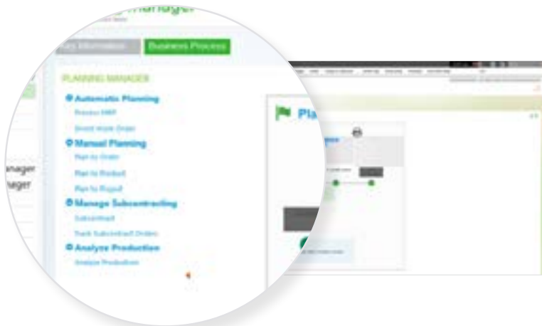
Document sharing across teams