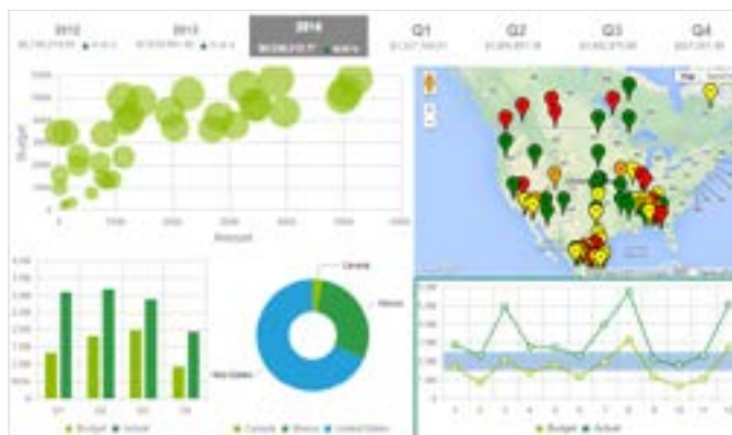
Revenue attainment dashboard

Stay ahead of trends and turn insight into action with built-in business object tools and a library of predefined reports that centralize data and delivers it on demand. Expand the core analytics capabilities with business intelligence options such as SAP BusinessObjects and Sage Enterprise Intelligence.