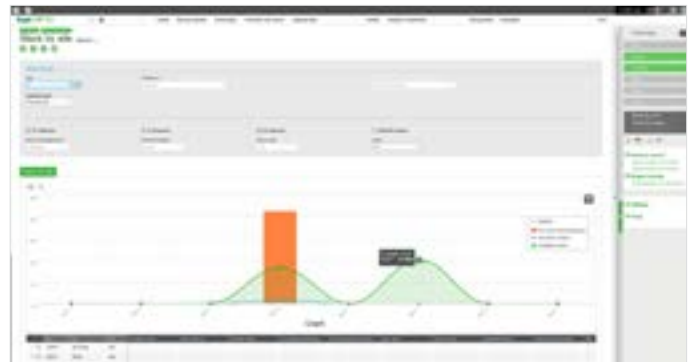
Available and scheduled inventory by site

Whether you're in one location or across the globe, Sage ERP X3 expands with your company. Scalability makes it easy to add users; user profiles and process workflows get existing and new employees up and running quickly. Expanding to a new location or market? Sage ERP X3 makes that easier by including multi-site, multi-company, multi-currency, multi-legislation, and multi-language capabilities.