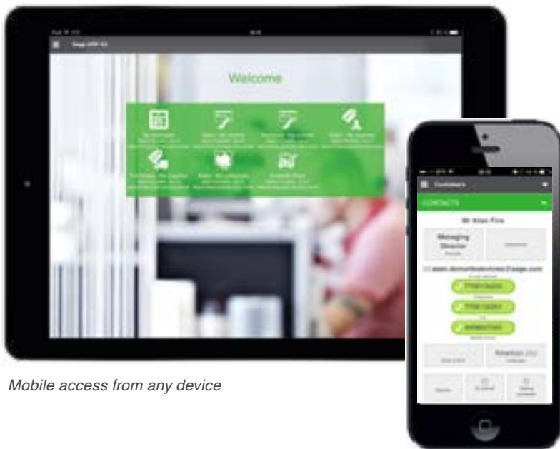
Mobile access from any device