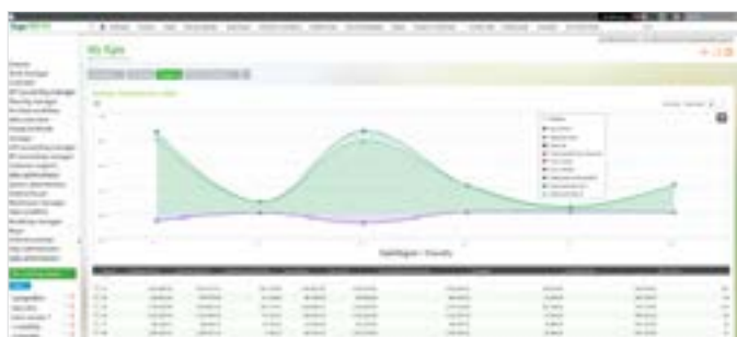
Inventory tool identifying anomalies